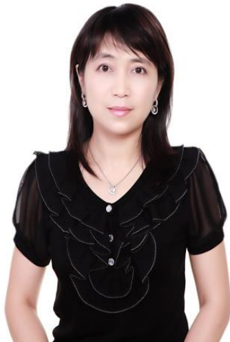
-- By Vivian Wu